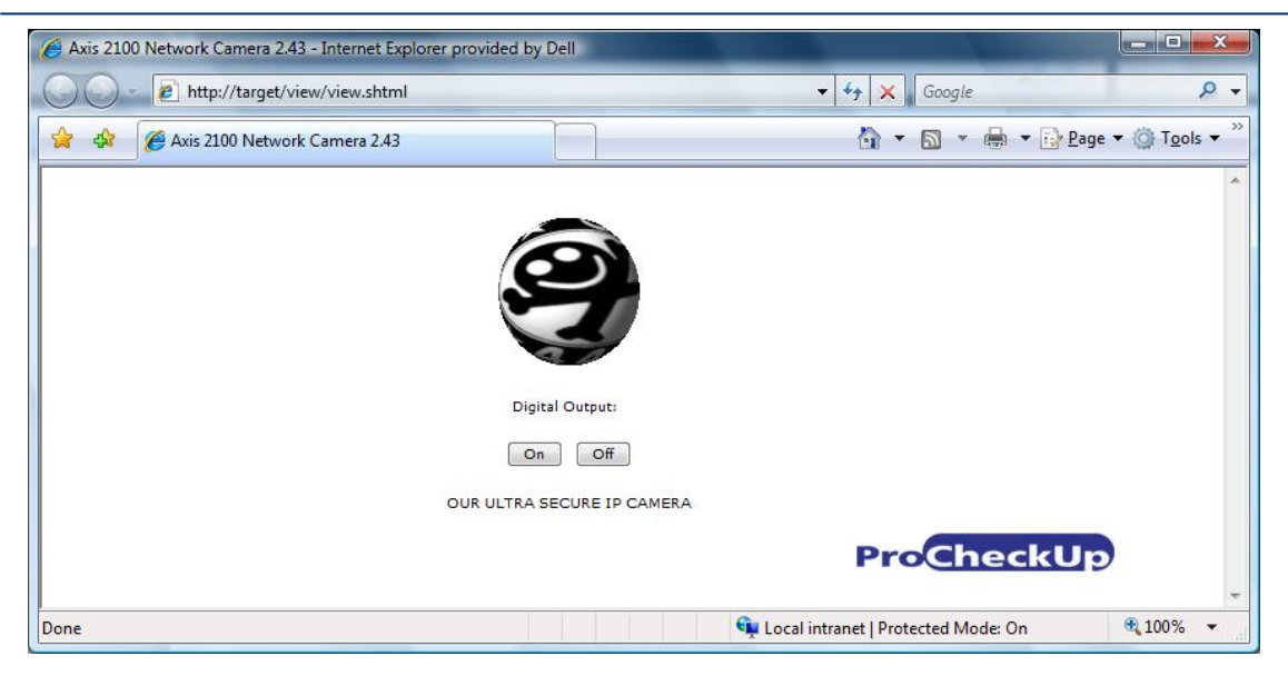
Figure 3 The original stream is replaced with a third-party animated GIF file